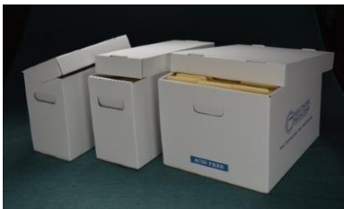
1 Acid Free Archival Bankers Box

As part of your gift we ask that you consider a donation to the museum to apply toward adequate storage of your object. Below are some recommended gift amounts based on the needs of the donation. Specific estimates can be obtained for you based on the objects you are donating.