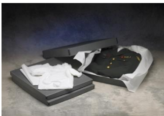
1 Keepsake Dress/Gown/Uniform Preservation Kit