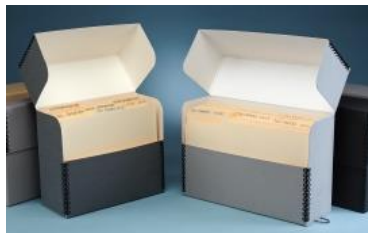
1 Acid Free Document Box