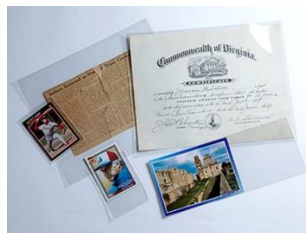
3 Mil Archival Polyester Envelopes