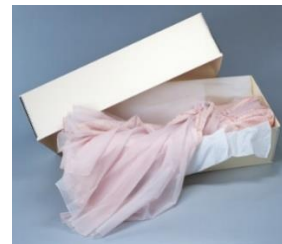
1 Costume Storage Box